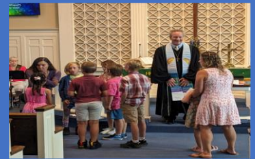
(Children of BUMC Learning a New Song)

This week in worship we will focus on Hebrews 13:1-8. We will explore how Jesus wants us to show hospitality to each other. Join us for worship in the Sanctuary or online at 9am & 11am in person or on Facebook Live & YouTube (Baylake United Methodist Church).