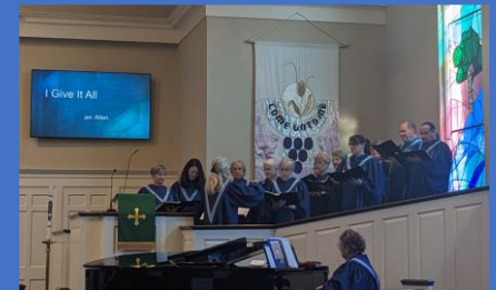
(Baylake UMC Choir)

WORSHIP This week in worship we will focus on Romans 10:5-15. We will explore how we witness to God. Join us for worship in the Sanctuary or online at 9am & 11am in person or on Facebook Live & YouTube (Baylake United Methodist Church).